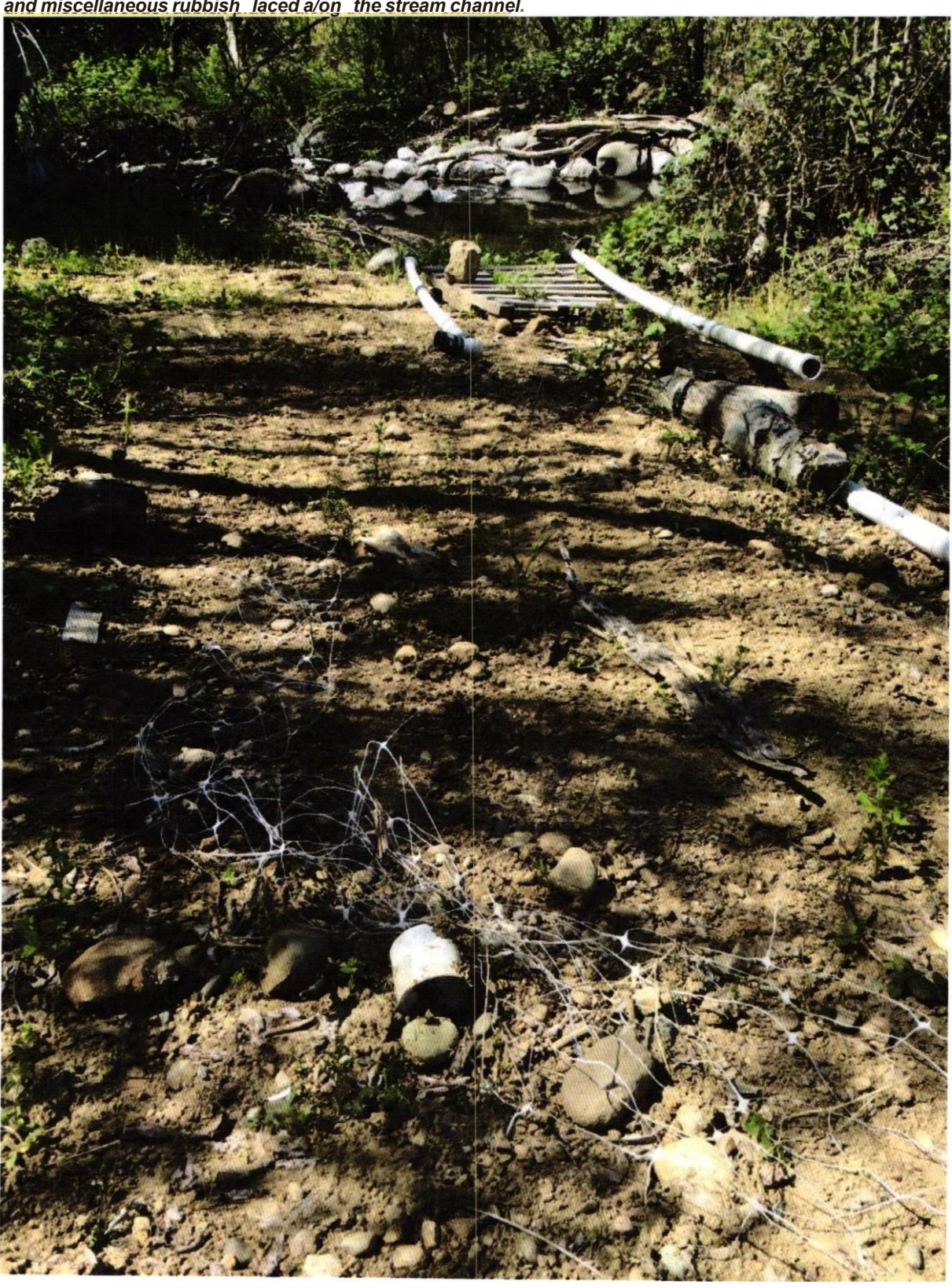
Figure 5: Access road to stream channel, eroding and discharging sediment to the stream. Diversion infrastructure and miscellaneous rubbish_laced a/on_the stream channel.